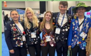
This photo shows Exchange Students in Calgary this week.